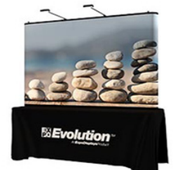
Mini Flat Wall Pop Up Wallwasher Kit