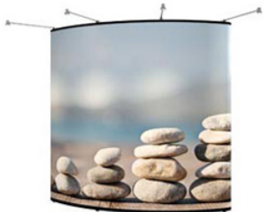
8' Convex Deluxe Pop Up