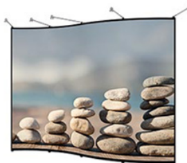
10' Serpentine Deluxe Pop Up