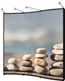
8' Serpentine Deluxe Pop Up