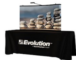
Mini Concave TT Wallwasher Kit