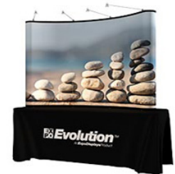
8' Concave TT Deluxe Table Top