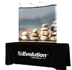
6' Concave TT Deluxe Table Top