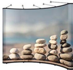
10' Concave Deluxe Pop Up