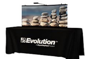
Micro Concave TT Wallwasher Kit