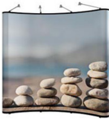
8' Concave Deluxe Pop Up